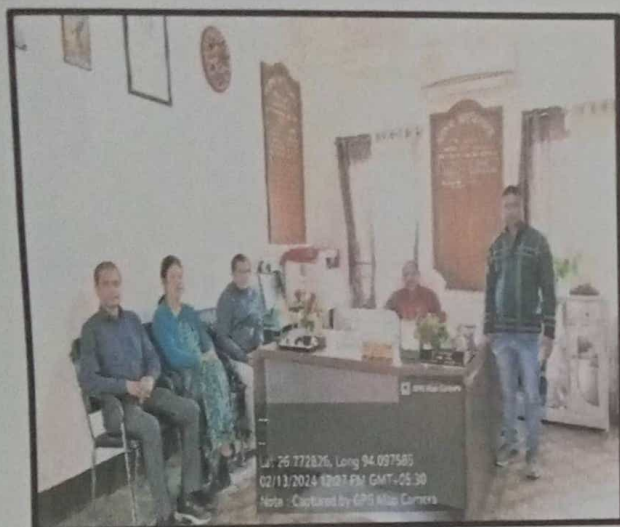
VISIT TO SARBODAYA COLLEGE, JORHAT